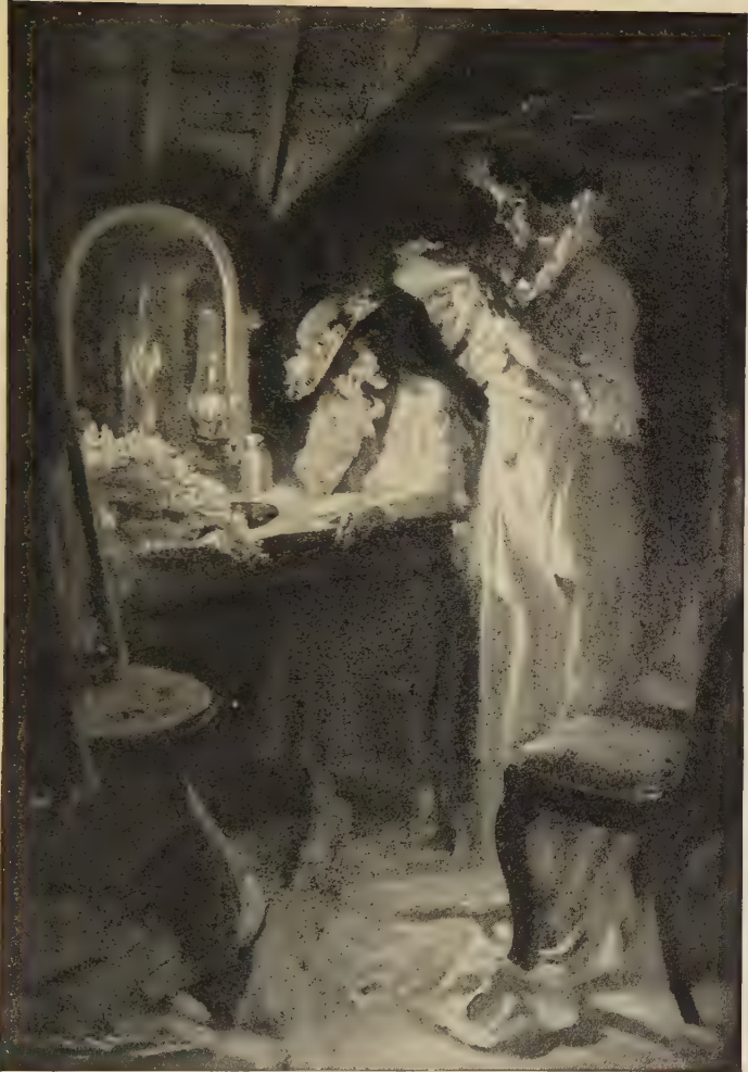
FROM INSIDE HER CORSAGE SHE BROUGHT OUT A LETTER